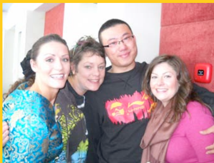
Hard to say goodbye to our wonderful interpreter.