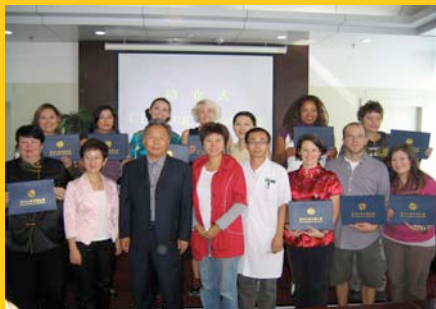
We received our diploma!