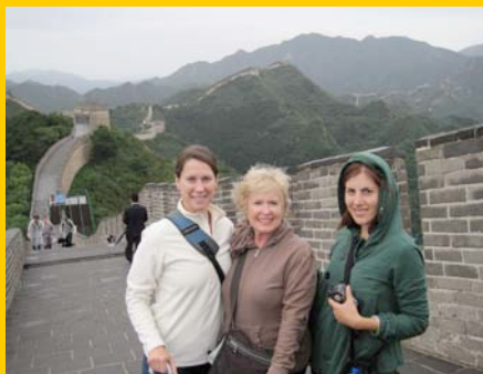
We are on the Great Wall!

Program Cost: approximately $6,000 Including: airfare, tuition, hotel lodging, breakfast, city sightseeing, diploma, and graduation Optional Beijing Trip: $500 (by train) or $700 (by airplane) (including transportation cost, hotel, all meals, all sight-seeing cost, interpreter cost and air-conditioned bus)